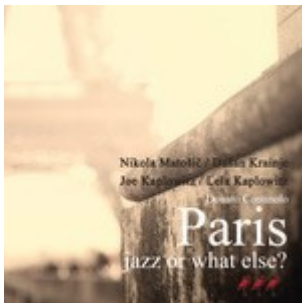
Donato Continolo - Paris - jazz or what else? (Egea Records, 2013.) - vocal appearance