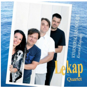
Lekap Quartet – Kvarnerska rapsodija (Menart, 2014.)