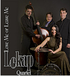
Love Me Or Leave Me - Dancing Bear, 2010